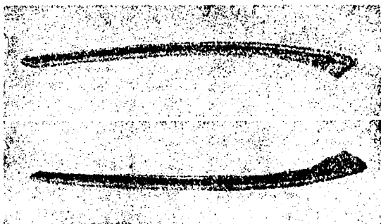
Fig. 5. Right ulna of Asio pigmaea sp. n. Type of description. Length—59.7 mm.

to the fact that the fossil humerus is much larger and more slender, its shaft is thinner. Its length measured from the top of caput. art. to the hindmost point of trochlea radialis is 50.5 mm in the fossil tattler, 43.5 mm in T. totanus . The thickness of the shaft in the midlength is 3.5 and 3.2 mm respectively. Hence the bone belongs to a larger and a more long-winged tattler.